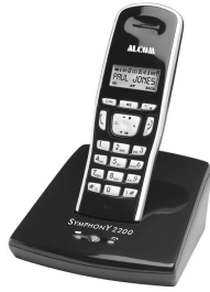
Digital Cordless Telephone

THIS EQUIPMENT IS NOT DESIGNED FOR MAKING EMERGENCY TELEPHONE CALLS WHEN THE POWER FAILS. ALTERNATIVE ARRANGEMENTS SHOULD BE MADE FOR ACCESS TO DIAL EMERGENCY SERVICES.