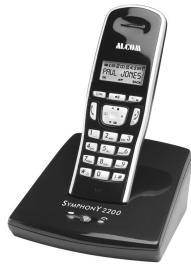
Digital Cordless Telephone

THIS EQUIPMENT IS NOT DESIGNED FOR MAKING EMERGENCY TELEPHONE CALLS WHEN THE POWER FAILS. ALTERNATIVE ARRANGEMENTS SHOULD BE MADE FOR ACCESS TO DIAL EMERGENCY SERVICES.