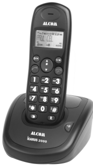
Digital Cordless Telephone

THIS EQUIPMENT IS NOT DESIGNED FOR MAKING EMERGENCY TELEPHONE CALLS WHEN THE POWER FAILS. ALTERNATIVE ARRANGEMENTS SHOULD BE MADE FOR ACCESS TO DIAL EMERGENCY SERVICES.